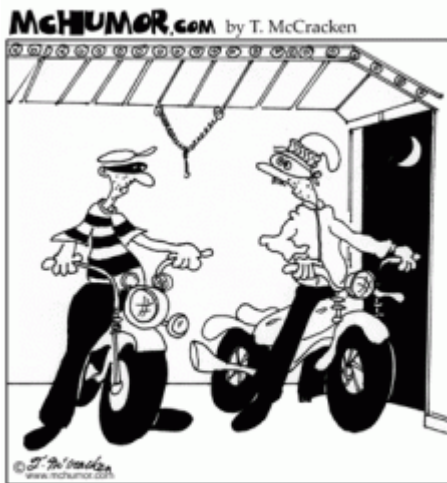
“No, no, lets steal this one. It has a lifetime warranty.”